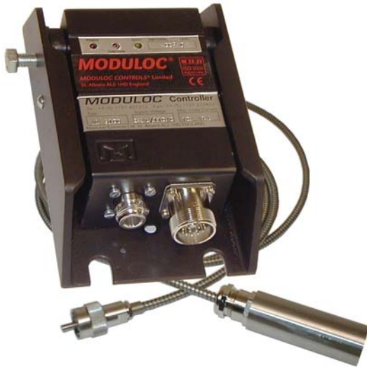
"ALL-IN-ONE" Remote Design utilizing 400°C Optic Leads & Remote Lenses.